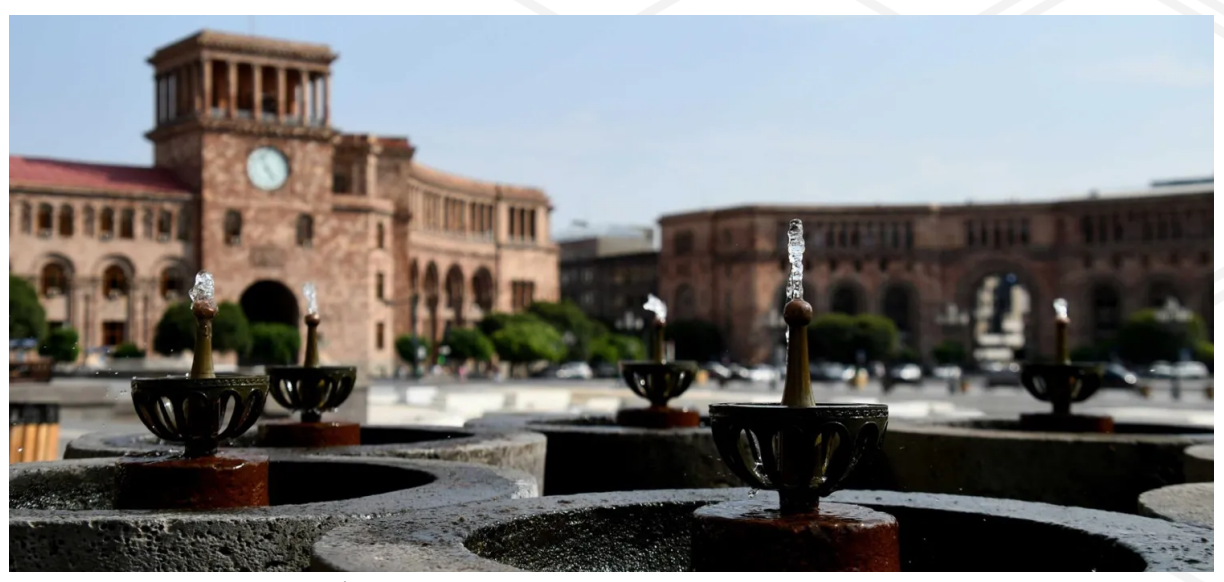
Pulpulak "Seven Springs"